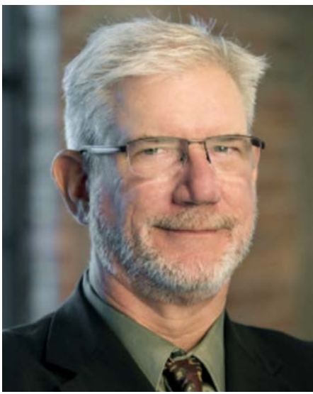
DOWNTOWN COUNCIL OF KC - SUBMITTED Bill Dietrich

The core function of the downtown area has changed from industry to office, and now it's changing from solely office to a mixed-use environment. Richard calls the office market pre-COVID one of the last vestiges of the Industrial Age. We used to stack people in factories, and then we offshored the factories. Next we stacked people in office buildings, and now we're evolving